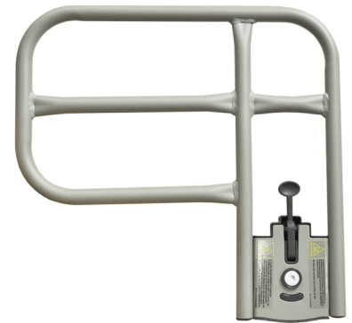
Three Position Rotating assist bar